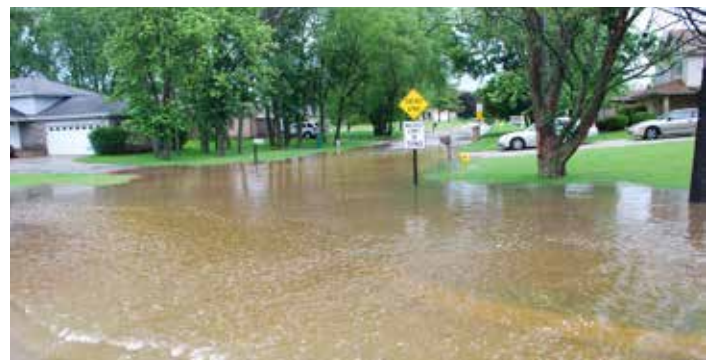
Flash flooding occurring at the intersection of University Parkway and Pine Trace Ct., June 15, 2015.

Additionally, the NMSP has applied to the Open-lands Foundation's ComEd Green Regions program for matching Bill Dodd funding to create the Nathan Manilow Sculpture Park Butterfly Ranch . Eleven-plus acres of open space in the western area of the park would be developed as a butterfly nursery while maintaining native prairie plantings. The ComEd Green Regions grants will be announced in late June.