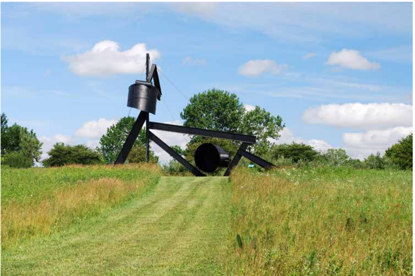
Yes! for Lady Day 1968-69; Mark diSuvero; Gift of Lewis Manilow

Flying Saucer , Jene Highstein's 1977 work that holds down the western section of the park, is scheduled for work this summer. Over the past 16 years it has developed a series of cracks that threaten the structural integrity of the artwork. The work is expected to take 2-4 weeks and will result in a presentation that more closely resembles the artist's vision than the current state of the sculpture. Stay tuned and make sure you visit Flying Saucer after July 1!