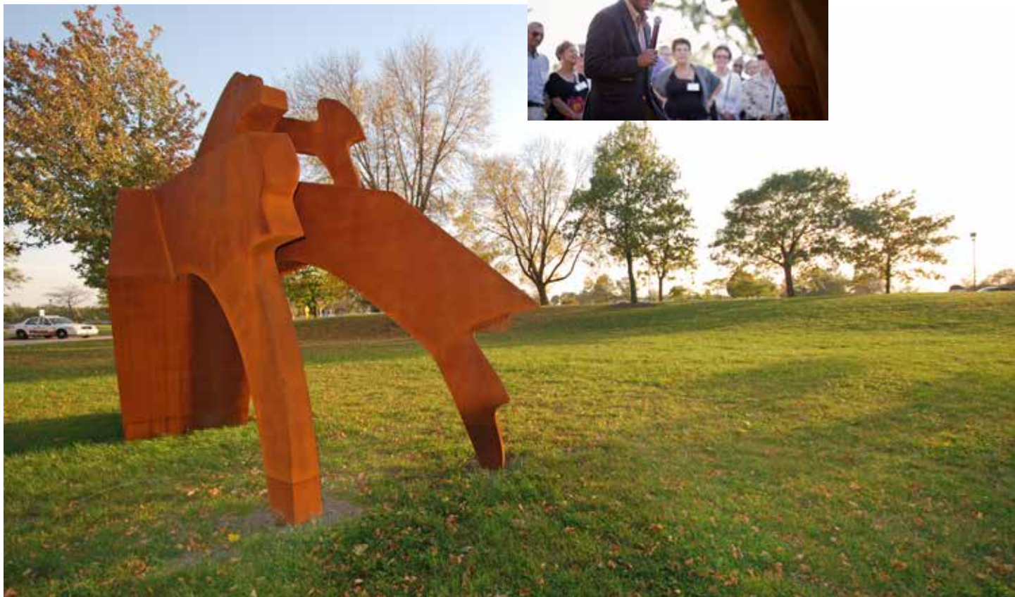
Large Planar Hybrid

If you haven't visited since last summer, you haven't seen the new installation of Richard Hunt's two works in the collection of the NMSP: Large Planar Hybrid and Outgrown Pyramid II . These two were paired in a 1978 exhibition, Sculpture in the Park and then made their ways separately to the NMSP, arriving in 1980 and 1984, respectively. They lived for 31 years in different areas of the park – Large Planar Hybrid was sited near B Wing entry and Outgrown Pyramid II could be seen as you entered the campus from the east. Last summer the two works were conserved and reunited for the first time in 38 years. Richard visited last September and approved – now it's your turn!